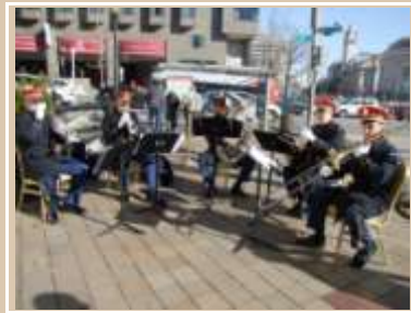
U.S. Army Brass Quintet performing during dedication

We are excited about the activities we have already held this Civil War Sesquicentennial year as we continue to work towards the November 2011 re-enactment of Lincoln's Grand Review of 1861 at Bailey's Crossroads.