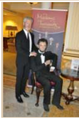
FForStephen Lang and Lincoln Replica

For our readers who live in the Washington, DC, area and for others who will be traveling here in June and July, consider stopping at the Willard InterContinental Hotel's Peacock Alley area to view a three-dimensional photographic exhibition of Civil War images. The exhibit is being presented by the Civil War Trust and the Hotel and is part of a year long commemoration of Civil War-related events. The free display is open to the public every day, from 9:00 a.m. to 6:00 p.m., June 24 - July 15, 2011.