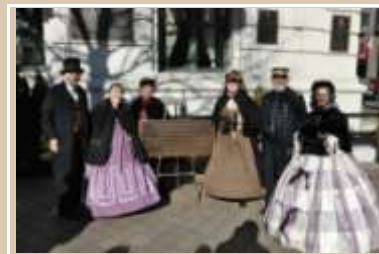
Members of the Victorian Society

In other news, our partner, the Bailey's Crossroads Revitalization Corporation (BCRC), submitted an application that was approved to the Virginia Sesquicentennial Civil War Commission to host the Virginia HistoryMobile for two days (November 11 - 12) which will coincide with the events surrounding the re-enactment of the Grand Review. The HistoryMobile will be an interactive and immersive experience that will help visitors better understand the challenges faced during the Civil War by soldiers, civilians, and slaves, and will present the losses, gains, and legacies of the Civil War in Virginia. You can read about the HistoryMobile at http://virginiacivilwar.org/historymobile_news.php .